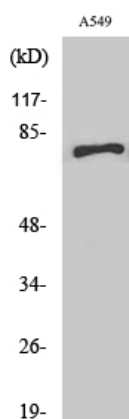
Western Blot analysis of various cells using APPL1 Polyclonal Antibody